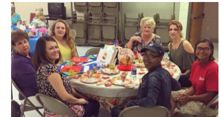
Women's Ministry Birthday Celebration held Thursday night

7501 Airport Blvd Mobile, AL 36608 251-639-9952 wemochurch.org